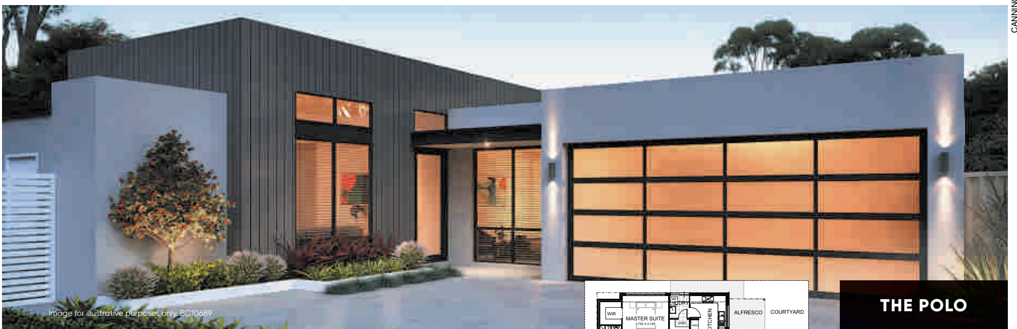
Image for illustrative purposes only. BC10689

"If possible, increase your home security by installing sensor lights or an alarm system and remember to turn them on before you leave. We also want to remind people to maintain high security standards even when they're home."